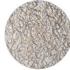
Silver/White Patina (FP/PB)