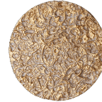
Gold/White Patina (FO/PB)