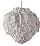
Silver/White Patina (FP/PB)