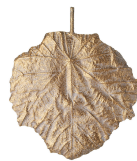
Gold/White Patina (FO/PB)