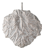
Silver/White Patina (FP/PB)